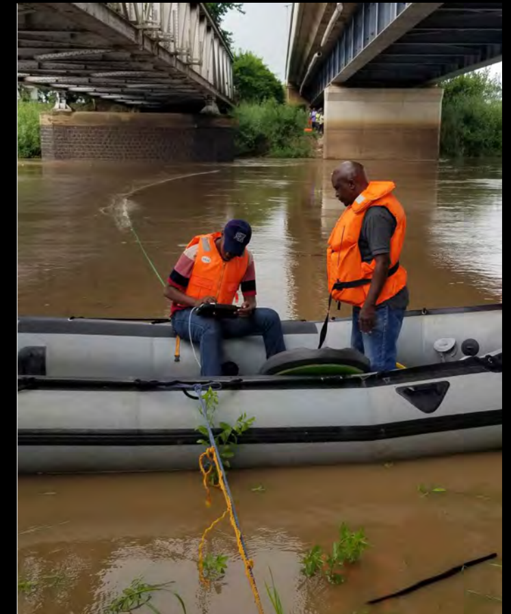
→ River Ruvu at Morogoro bridge.