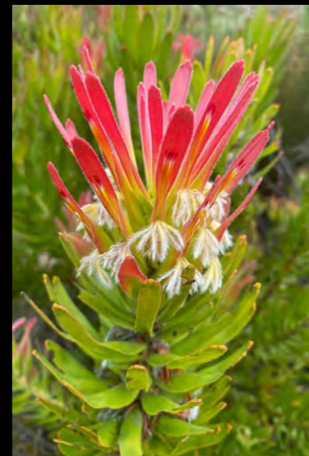
← Mimetes cucullatus, the common pagoda is one of the many fynbos plants which have returned to the restored slopes of the mountains of the Outeniqua Water Source Area as a result of the WWF SAB clearing efforts.