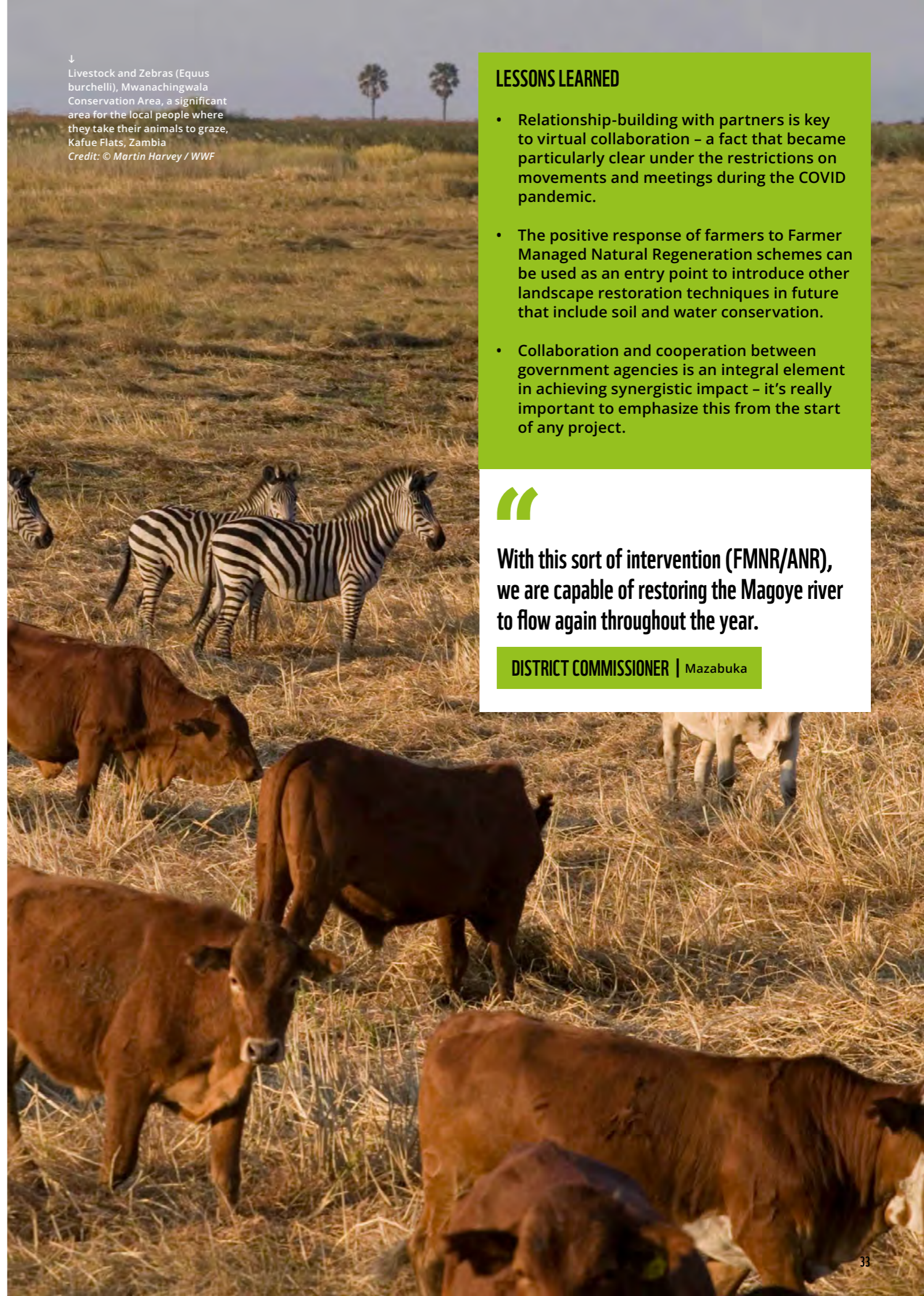
↓ Livestock and Zebras ( Equus burchelli ), Mwanachingwala Conservation Area, a significant area for the local people where they take their animals to graze, Kafue Flats, Zambia