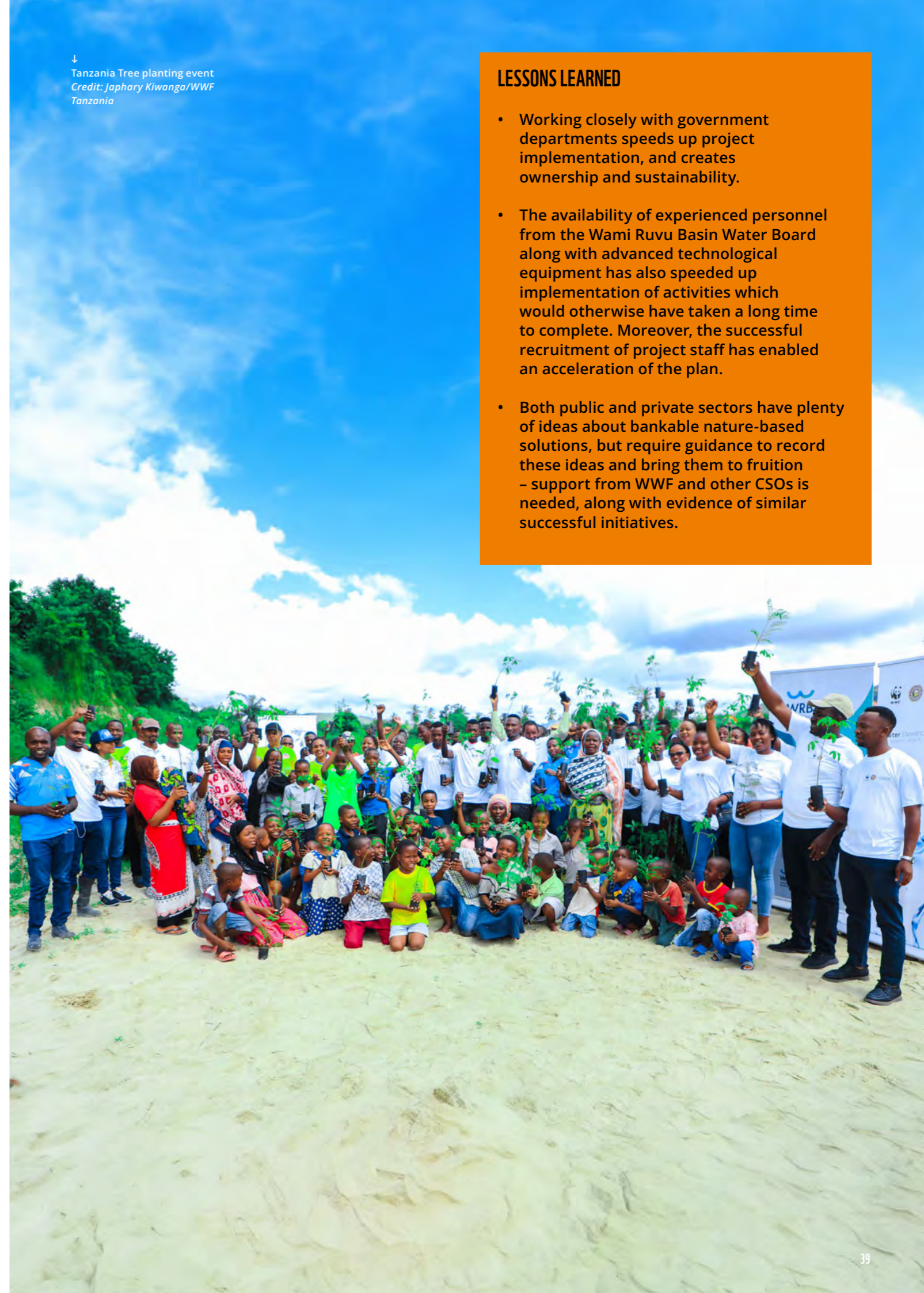
↓ Tanzania Tree planting event