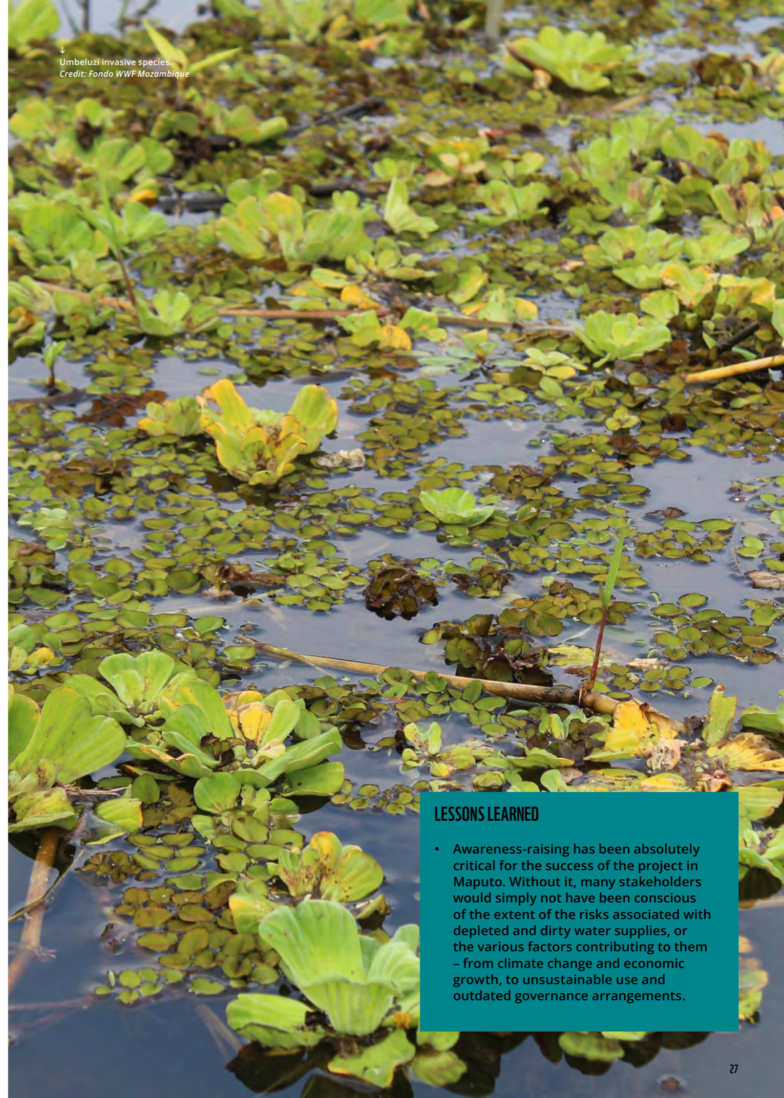
↓ Umbeluzi invasive species.