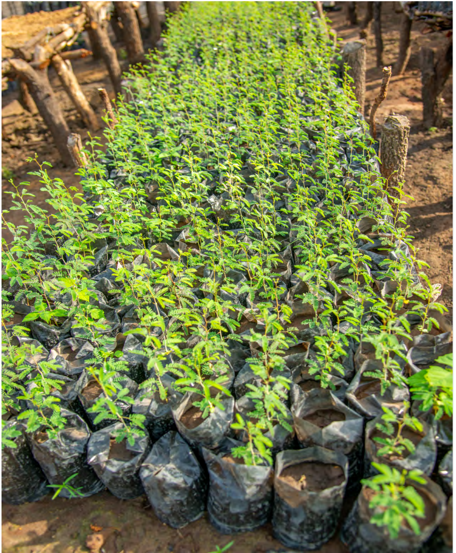
↑ Native tree seedlings in Zambian nursery .